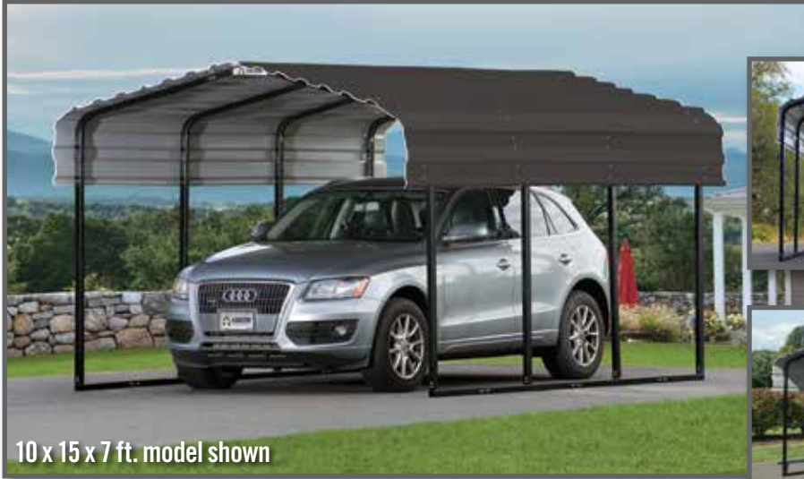
10 x 15 x 7 ft. model shown

Multi-use shelter and carport – perfect for vehicles, boats, tractors, and outdoor picnic areas and patio furniture.