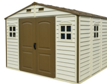
Front Right Angle View