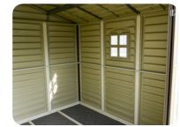
The wall columns, doors and roof are reinforced with solid metal support .