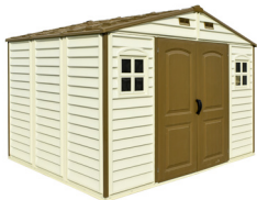
Front Left Angle View