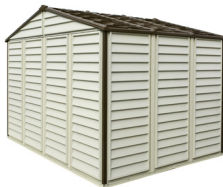
Back / Side View