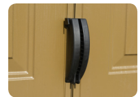
Lockable Door Handle