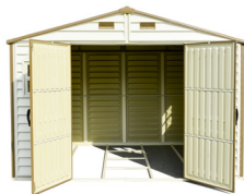
Front Door Open