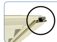
Snap-In Panel & Column