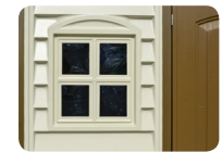
3 Windows Included (2 front & 1 right side)