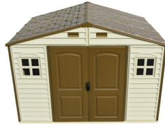
Roof Top View