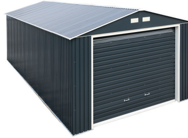
12' x 26'