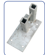
Ground Anchor is made of Heavy Duty Solid Steel Construction