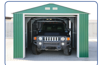
Available also in Green with Off White Trim & Off White with Brown Trim