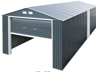
12' x 26'