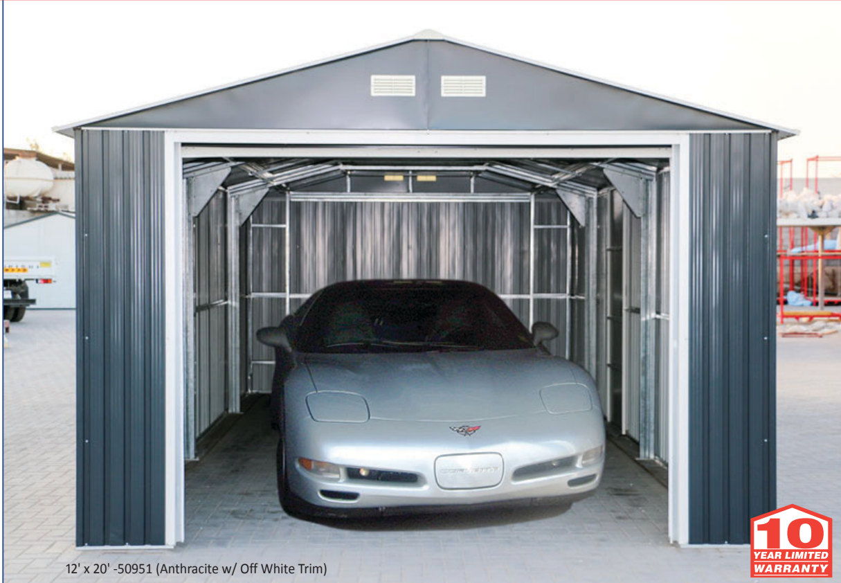
12' x 20' -50951 (Anthracite w/ Off White Trim)