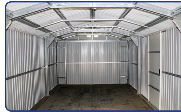
Inside Back View

Heavy Reinforced Galvanized Steel Roof Trusses, Beams and Wall Support