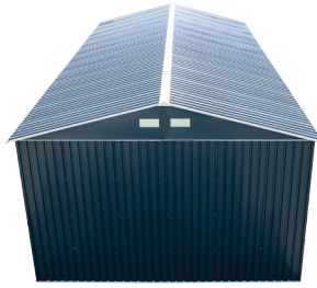
12' x 26'