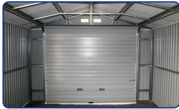
Inside Front View