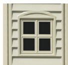
2 Side Window Panels