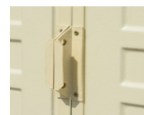
Lockable Door Handle