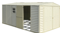
1 Side Door Included