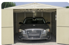
Perfect for Secure Parking