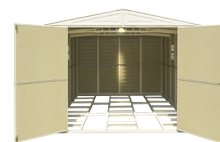
Wide 88" Double Doors