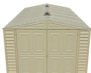
Roof Top View