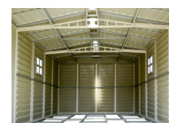
Strong Metal Frame for Roof & Side Wall Support