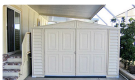
Perfect for Tight Space