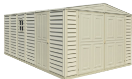
Left Angle View