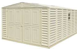
Right Angle View