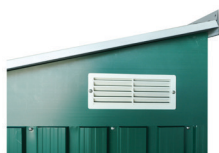
Side Air Vent for Storage Air Circulation