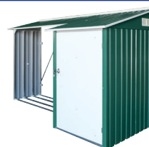
Built In Side Storage Room