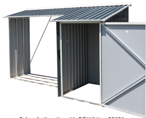
Color: Anthracite with Off White - 53651