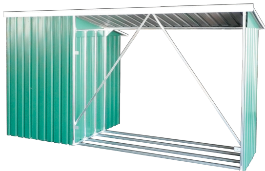
Color: Green with Off White - 53661