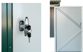
Door handle with Lockable Lock and Door Steel Cross Bar for Extra Support