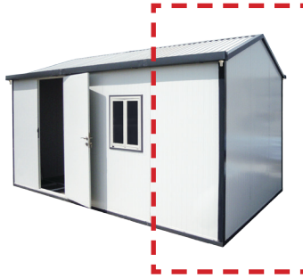
1 Extension Kit

Extension Kit Mountable on Left or Right Side