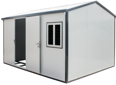
Standard Size 13' x 10'