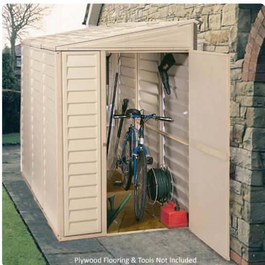
Plywood Flooring & Tools Not Included