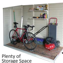
Plenty of Storage Space