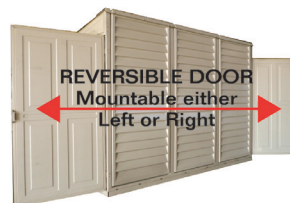
REVERSIBLE DOOR Mountable either Left or Right