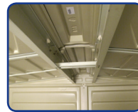
Strong Steel Roof Truss Carries 20 lbs/sqft Snow Load