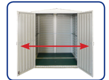
Wide & Tall Single or Double Doors