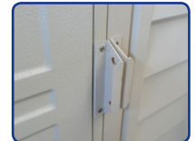
Door Handles with Padlock Eyes

When is a shed more than just a shed, our 10' x 5' Woodbridge 5 will be perfect adjacent to the side of a house or fence or garden for extra storage space.