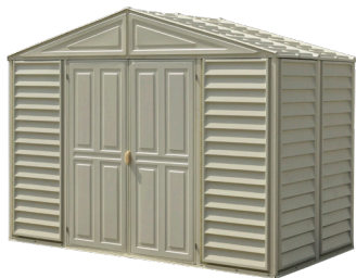
Front Angle View

This tall walk in shed features tall and wide double doors. The wall columns are reinforced with a solid metal structure that gives the shed strength and allows you to hang shelves or garden tools. These can also be used as a hobby or activity room.