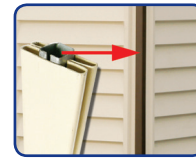
Sturdy Steel Reinforced Wall Columns