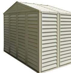
Back Angle View