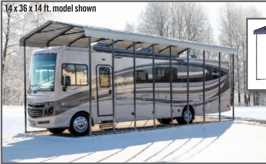
14 x 36 x 14 ft. model shown

Multi-use shelter and carport – Perfect for storing larger vehicles like Class A RV's, tractors, and boats.