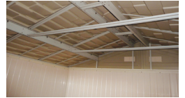
Metal Structure Roof Support