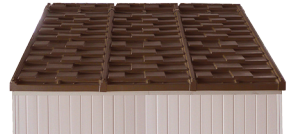
Brown Vinyl Simulated Wood Shingles