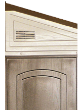
Fascia & Doors with WoodGrain Finish