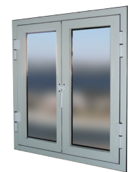
One Window Kit Included