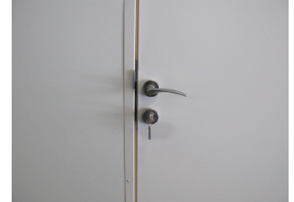
Door Knob and DeathBolt Lock Included