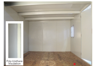
Building reinforced with metal columns and beams (wood flooring not included) Panel Walls are Fire-retardant CFC Free Poly-Urethane insulation