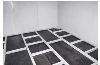
Galvanized Metal foundation Kit