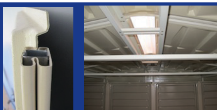
Strong Metal Wall Columns and Roof Support